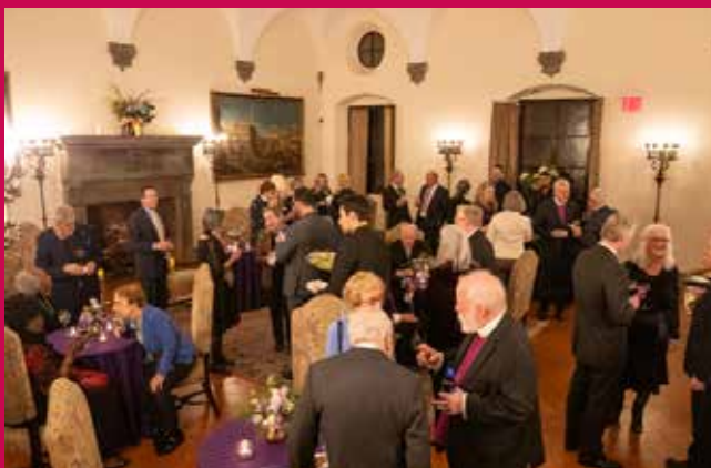
Refectory during the Winter Benefit Cocktail hour