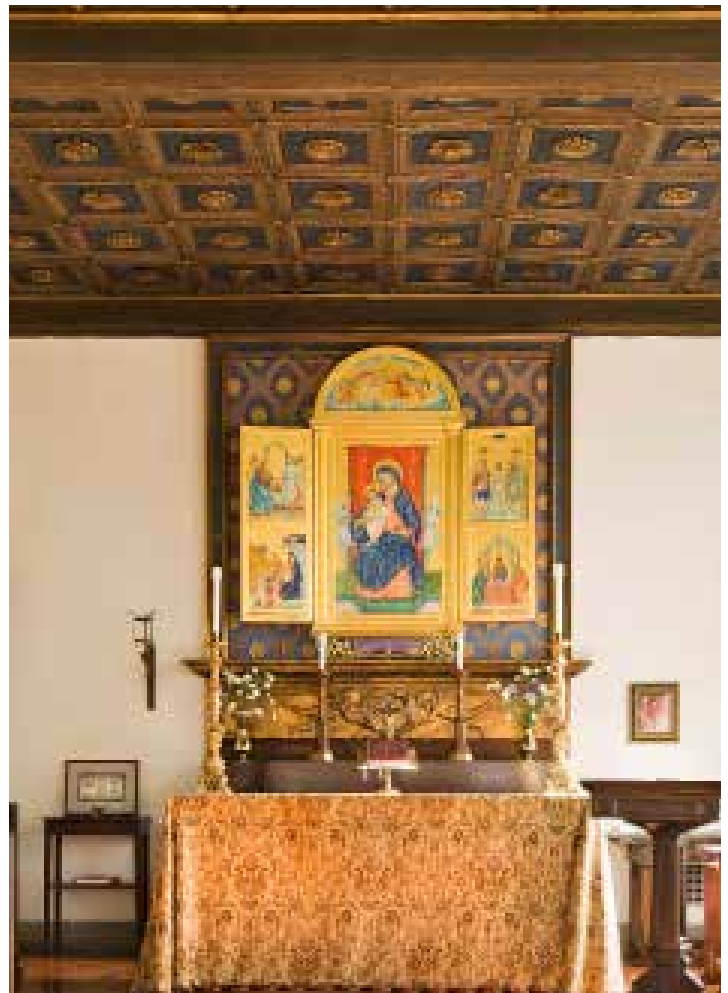
The House Chapel