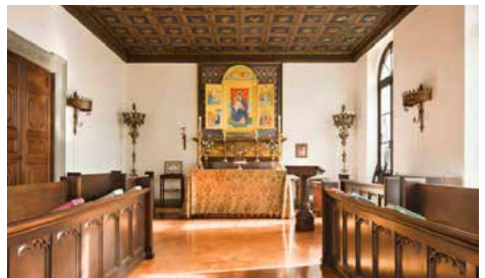
The House Chapel