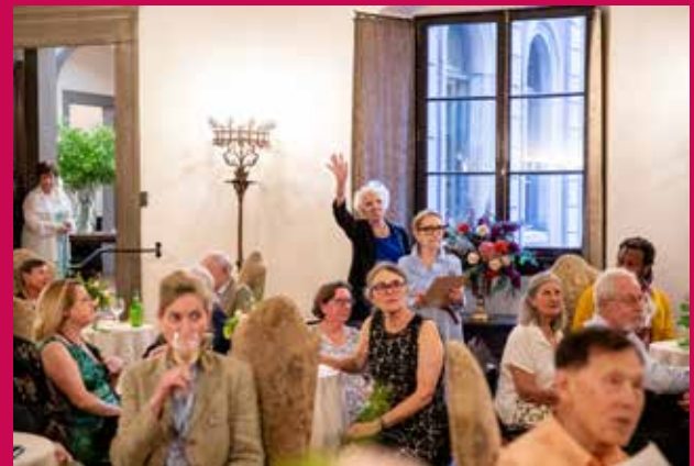
Bidding on the Auction