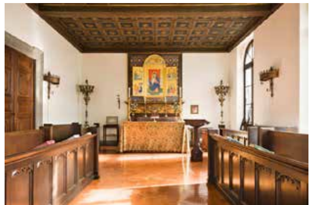
The House Chapel