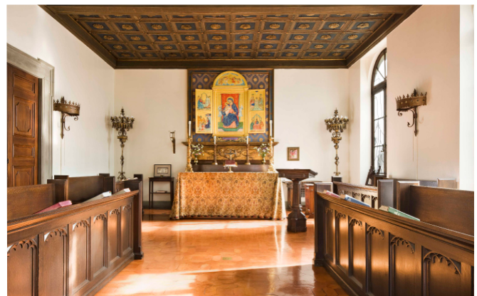
The House Chapel